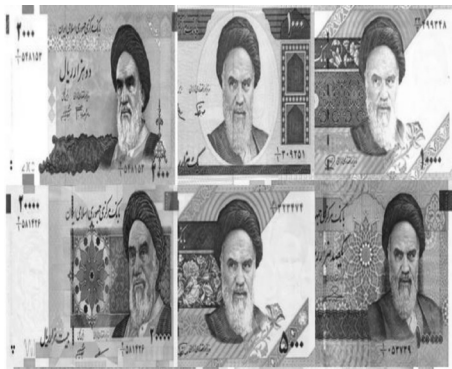
Figure 6. ( http://www.banknote.ws )

place in Persian mythology and folklore (the 10,000- rial banknote) (Figure 7). A photo of flowers and birds on the 5,000- rial banknote, Naqsh-e Jahan Square on the 20,000- rial banknote, the Aghazadeh Mansion on the 20,000- rial banknote, the University of Tehran’s main entrance on the 50,000- rial banknote, and the mausoleum of Iranian poet Saadi, on the 100,000- rial banknote all refer to Iran’s Islamic cultural life (Figure 5 and Figure 7, respectively).