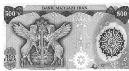
Figure 1. ( http://www.mebanknotes.com )

identities. This can be accomplished by issuing banknotes, coins, and postage stamps, all of which are designed to daily re-produce national and religious identity and to defend national identity against sub-national identities. Thus, I will refer only to those unique state visual symbolic tools and refer only to the state as regards the daily re-production of national identity.