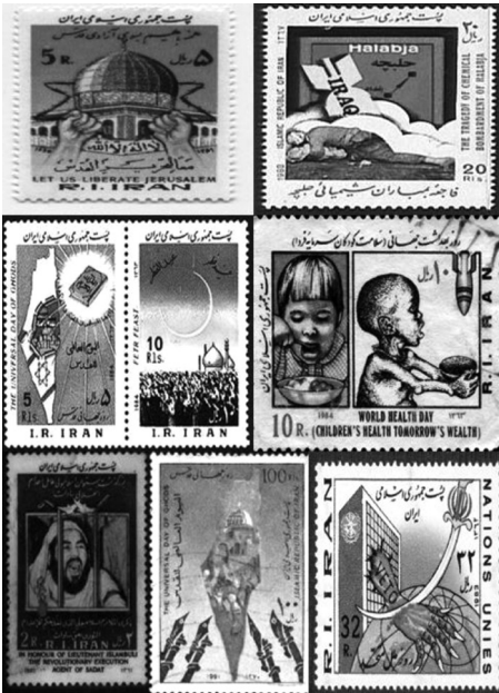
Figure 11. ( http://www.stampsofiran.com , http://www.iranstamp.com , http://www.stampworld.com , http://www.iranicaonline.org , http://thecahokian.blogspot.com.tr )

Tehran is usually portrayed as defending Iran against outsiders. In addition, stamps also depict the Iranian nation as rising on the legacy of Imam Hussein (martyred at Karbala), Imam Khomeini, and those martyrs who died during the revolution and the war with Iraq. In short, Iranian stamps daily reproduce the ‘religio-national’ Iranian identity.