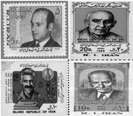
Figure 9.

A stamp’s visual qualities make it an important messenger that implements the state’s official outlook in its citizens’ everyday life (Raento & Brunn, 2005, p. 143). In their study on postage stamps as socio-political artefacts, Phil Deans and Hugo Dobson (2005, p. 3) define them as messengers that “... can and should be read as texts, often with expressly political purposes or agendas, which are conveyed through the images they depict”. According to them, these items emerge as vehicles for identity creation and propaga-