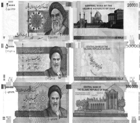
Figure 5. ( http://www.banknote.ws )