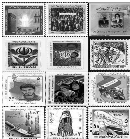
Figure 10. ( http://www.stampworld.com , http://www.stampsforiran.com , http://www.iranaiconline.org )

The second purpose is to remind Iranians of their national identity by combining several external events. Since the revolutionary regime declared itself the protector of all oppressed people worldwide, several independence movements and disasters were attached to this identity. Devoted to the concept of exporting its revolution, Tehran struggled to present Iranian national identity as an integral part of oppressed people, tragic events, important cases, anti-imperialism and